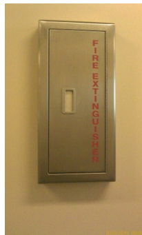
Fire Extinguisher (Two on each floor)